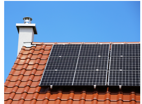
Figure 2 – Solar PV systems on new low-rise residential buildings is a new 2019 Energy Code requirement

Tables 150.1-A and B now include Prescriptive heat pump water heating options (see Mechanical Highlights below for more DHW detail). When combined with heat pump space heating, this allows for all-electric as well as mixed-fuel Prescriptive compliance options and adds the option of an all-electric Performance method baseline.